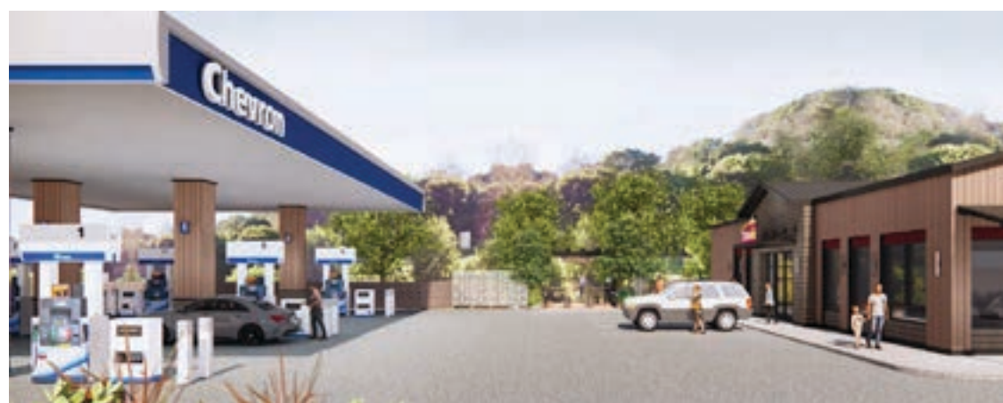
Rendering of view from Orinda Way